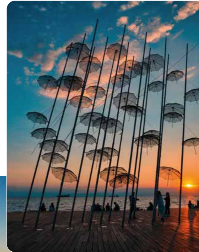
Umbrellas of Zongolopoulos