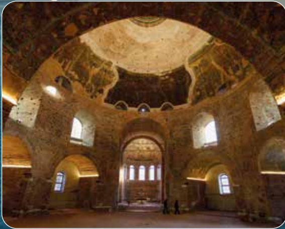
The famous Roman monument Rotunda