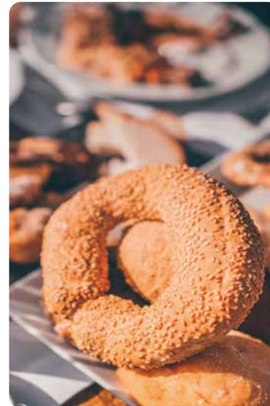
Koulouri, Thessaloniki's traditional snack

Thessaloniki is renowned for its lively nightlife and is the first city of Greece designated by UNESCO as a City of Gastronomy with famous restaurants and many local specialties.