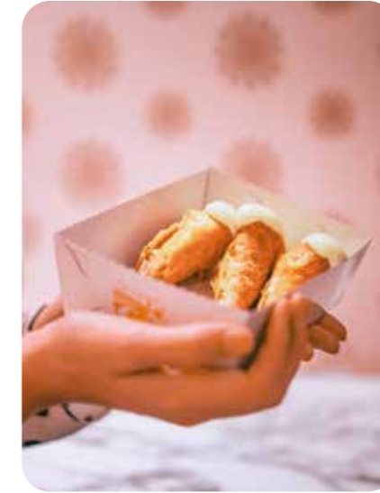
Trigona Panoramatos, a well-known traditional dessert