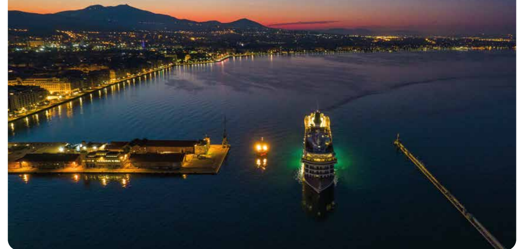
A cruise ship entering the port

“ It was a great discovery... Glad the Cruise company chose this port to visit ”