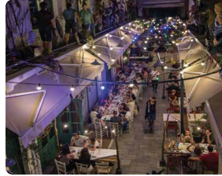
"Stoa Karipi", an arcade full of restaurants and taverns