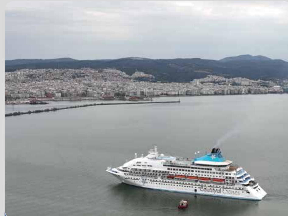
A cruise ship entering the port

15 UNESCO monuments, 30 museums, all within walking distance from the port!