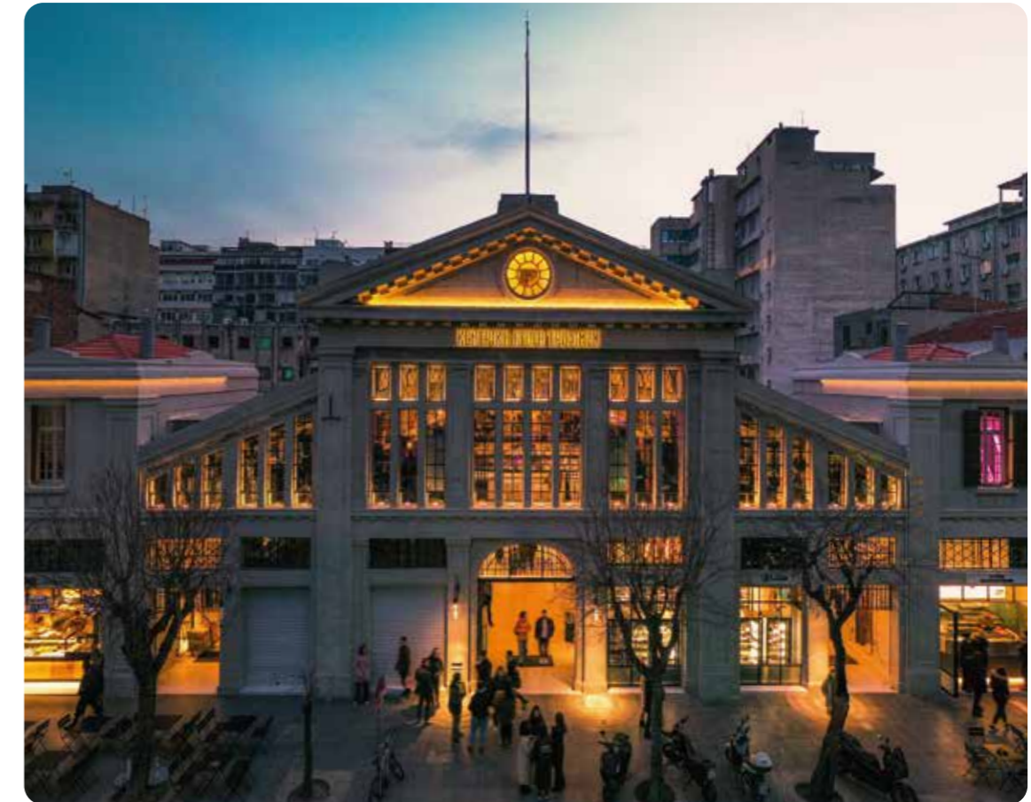
Agora Modiano, Thessaloniki's landmark and Central Food Market refurbished, 100 years after its creation