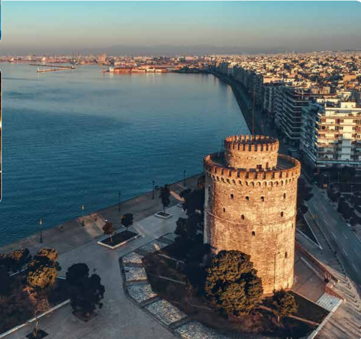
The White Tower